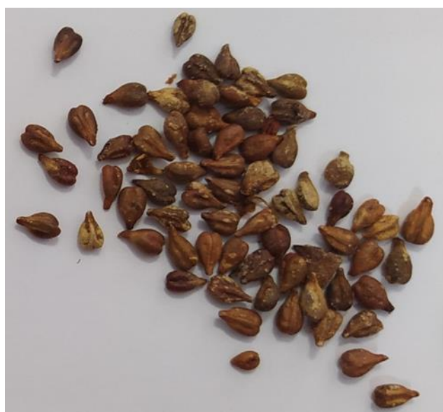
FIGURE 1. Grape seeds of the Kisi variety

Ultrasound-assisted extraction (UAE) was used to prepare the extracts. UAE is an innovative technique that enhances extraction using high-frequency sound waves (20–100 kHz). These sound waves generate cavitation bubbles in the solvent. As the bubbles collapse, they release significant energy through high pressure and temperature, breaking plant cell walls and releasing phenolic compounds into the solvent. UAE offers several advantages over traditional methods, including shorter extraction times, higher yields, and reduced solvent consumption. Moreover, it is an environmentally friendly technique, allowing the use of non-toxic, food-grade solvents, such as ethanol. UAE is also cost-effective, requiring less energy and simplifying the extraction process compared to conventional methods. 11,12